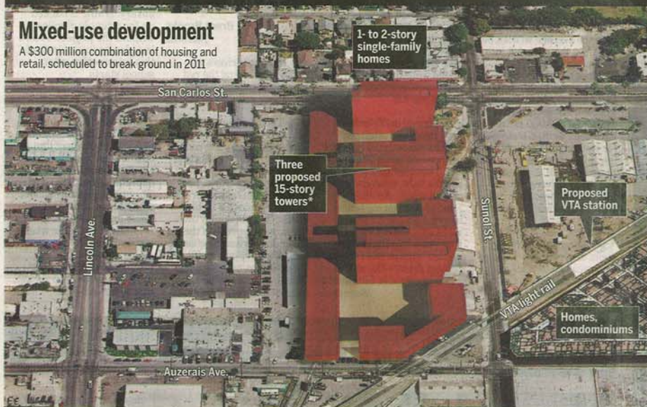
2005 aerial photo by Pictometry.com. *Conceptual model for proposed zoning. Final design to be determined.

A $300 million combination of housing and retail, scheduled to break ground in 2011